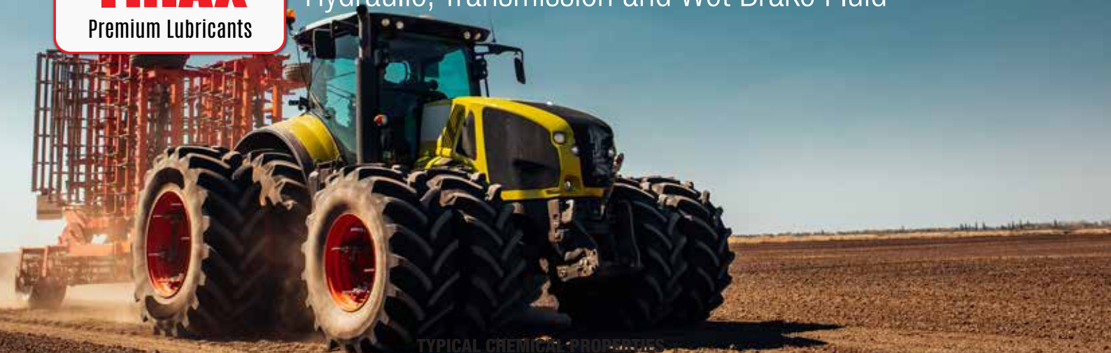
TYPICAL CHEMICAL PROPERTIES

Full Synthetic Extreme Performance Tractor Hydraulic, Transmission and Wet Brake Fluid