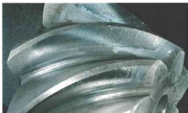
Gear scoring from regular tractor fluids on pinion and ring